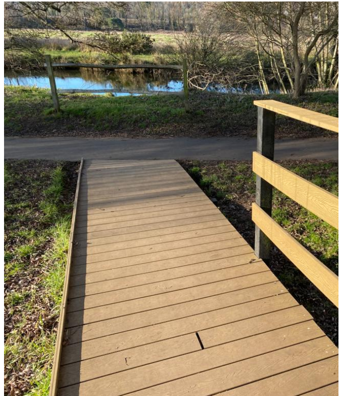
(Example of sustainable composite decking at Godalming, Surrey)